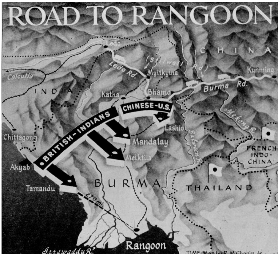
Fig. 3. The Ledo (Stilwell) road (a wartime map)

The decision to construct a motorway to connect India and China was also made in 1942. The first convoy consisting of 113 vehicles travelled the 1736 km road (fig. 3) only in January-February 1945, which took three weeks. The gigantic structure included not only the road itself but also a petrol pipe for supplying Chinese allies and fuelling passing convoys. The capacity of the Stilwell road did not increase until the end of the war. Nevertheless, even limited operation of the road made it possible to transfer hundreds of lorries to the Kuomintang.