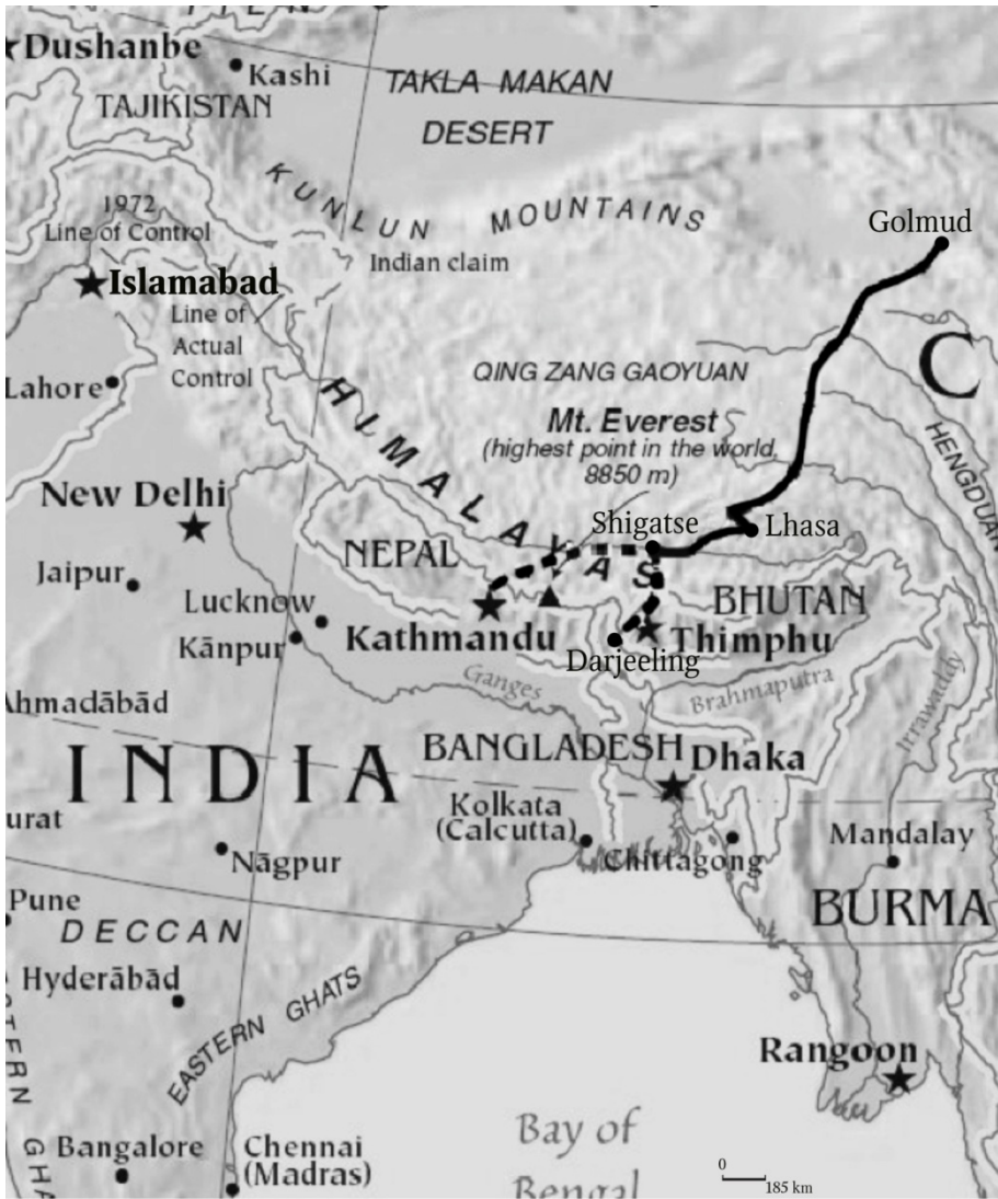
Fig. 2. The Qinghai-Tibet railway and its possible extensions

Another obstacle to heavy-duty traffic is that locomotives have to operate in the conditions of extremely thin air. Even passenger trains are hauled by three General Electric locomotives from Golmud to Lhasa and by two in the opposite direction (the pressure and oxygen content in the cars is maintained at the level that prevent passengers from developing mountain sickness). Electrification can solve this problem but it will also bring new issues relating to power generation. Obviously, large exports of energy and water-intensive produce from Eastern Siberia to India require constructing a railway of a larger capacity.